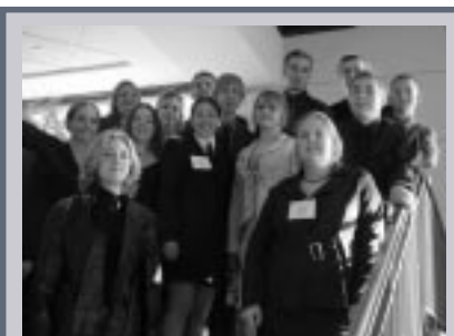
SFT FBLA brought 14 members to this year's NFLC

Presently, SFT FBLA members are preparing for competition at the District VII conference to be held at Hartford High School, Monday, January 19th. They are very excited about the upcoming season of events for our chapter.