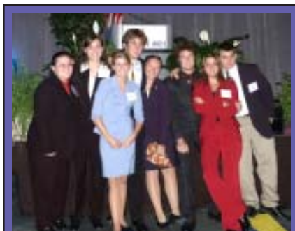
Pleasant Ridge FBLA members and chapter officers traveled to Omaha, NE for the National Fall Leadership Conference.

Earlier in October, the chapter held a best legs contest to raise