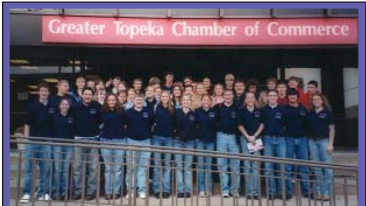
The Rossville FBLA Chapter participated in American Enterprise Day by visiting the Target Distribution Center and the Greater Topeka Chamber of Commerce.

ber of Commerce. There they watched a presentation on how the