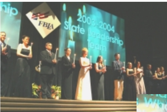
The newly elected State Executive Board was installed at the Awards Ceremony.