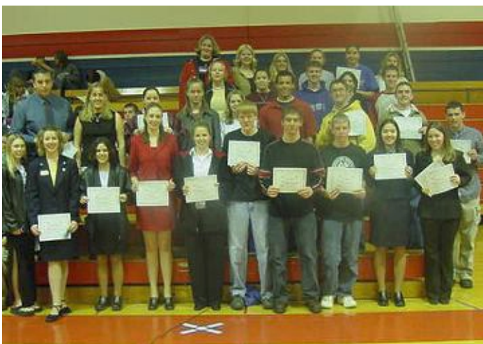
Many Santa Fe Trail Members placed at the District VII Conference and they placed first overall as a chapter.

Access the webpage today at www.ksfbla.org!